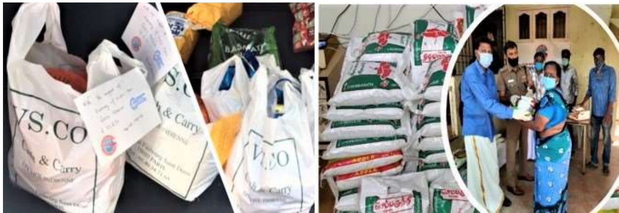
Photo; Food distribution by GOPIO-France Paris (left) and GOPIO-Chennai.