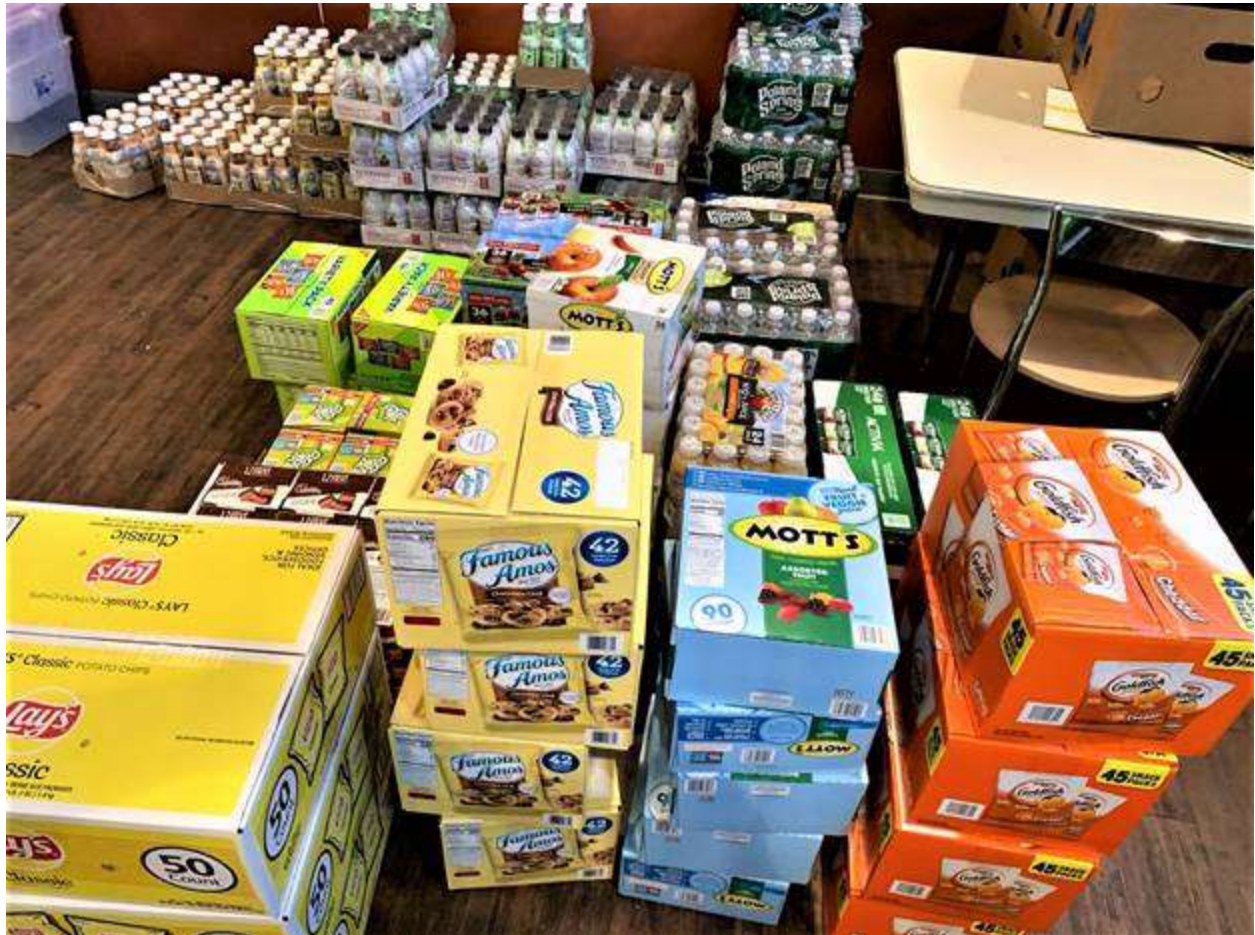
GOPIO-CT deliver food items to at the New Covenant House by Shelly's team on April 22 nd , 2020