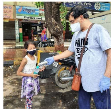
Photo: GOPIO-France Paris President (top left) distributing food in Mumbai and Navi Mumbai.

The organizers were utmost satisfied to bring happiness and see the smiles on the faces of the people & children after getting food.