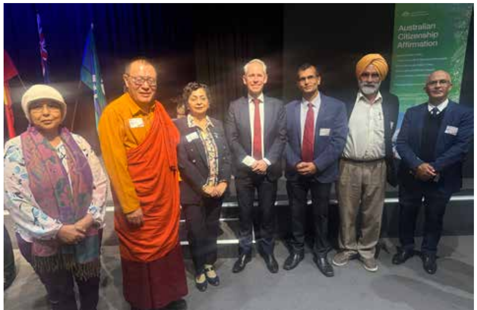
Members of the community with MP Andrew Giles discussing Refugee issues and attending citizenship ceremony to mark Refugee week

This is for a child born overseas who is