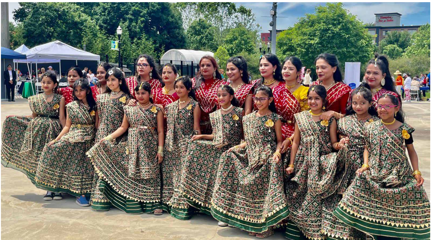
Gujarati Dancers at the Stamford Day Celebration

Stamford's history and diversity. Stamford was founded on May 16th, 1641, 383 years ago, and has grown into one of the most