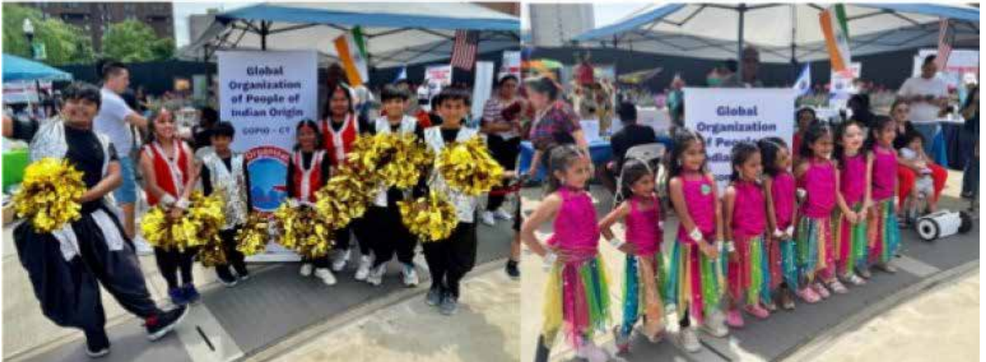
Young Bollywood Dancers at the Celebration

The Global Organization of People of Indian Origin—Connecticut Chapter (GOPIO-CT) has been