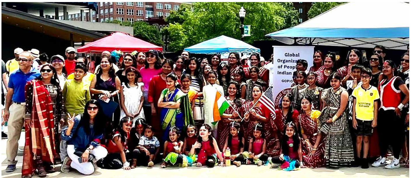
All dancers, parents with GOPIO officials

Mill River Park is located in Downtown Stamford, like Central Park for Stamford.