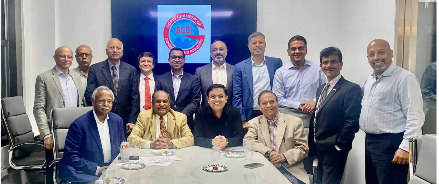
GCCI Meeting held on May 23rd in New York City.

After relaunching the GOPIO Chamber of Commerce and Industry (GCCCI) at the GOPIO Convention 2024 in April 2024, GCCCI held a brainstorming session.